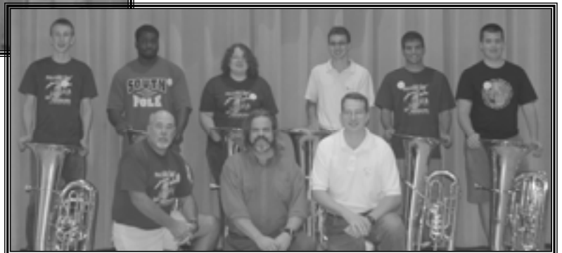
Tuba Students and Judges