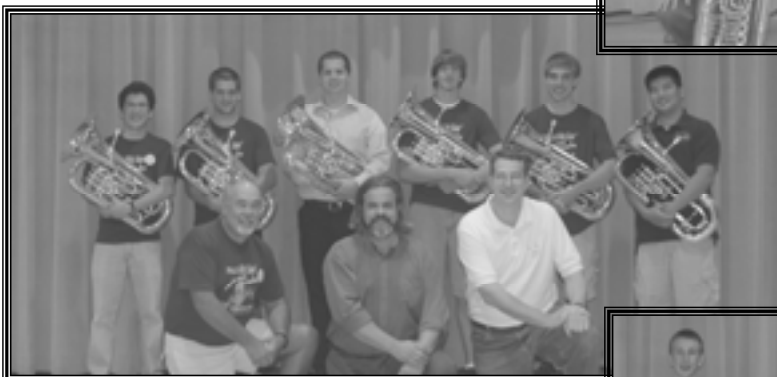
Euphonium Students and Judges