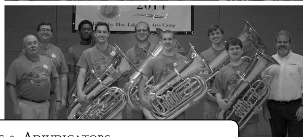
2014 FESTIVAL COMPETITORS & ADJUDICATORS Clockwise from top left: Euphonium Artists, Tuba Artists, Tuba Students, Euphonium Students